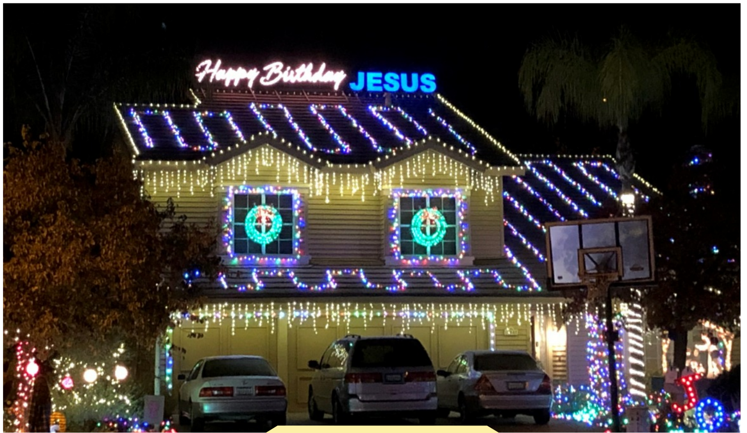
Candy Cane Lane

What's Inside: President's Corner Board of Directors Club Events Calendar About Our Club